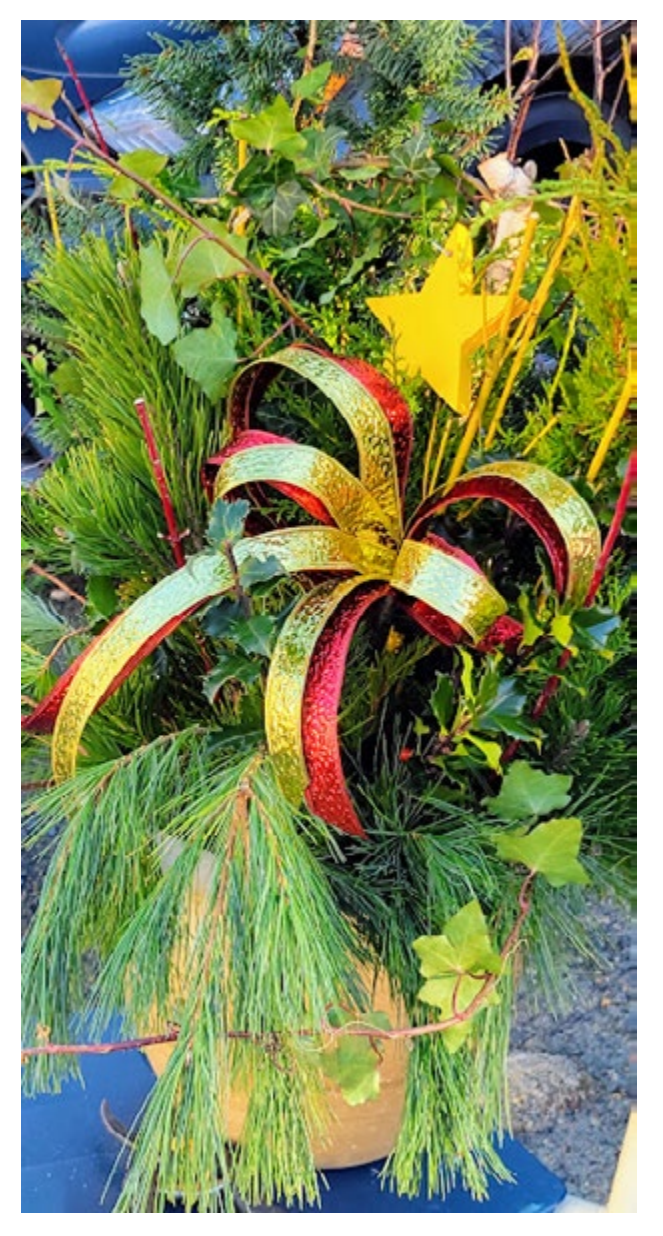
A very pretty arrangement to mark the holiday season