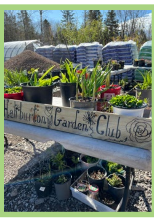
Haliburton plant sale