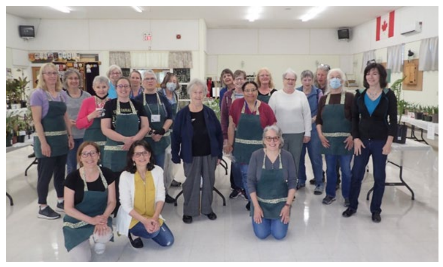
Excitement builds as the Eastern Shore Garden Club plant sale volunteers get ready to welcome eager shoppers!

While 2023 started off with challenging weather, forcing the cancellation of both our February and March meetings, the Eastern Shore Garden Club eagerly geared up for spring gardening and our annual plant sale.