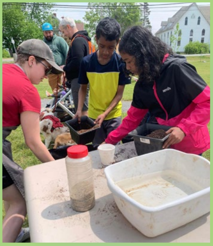
The children's free butterfly planter workshop (above)